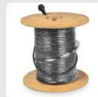
H35 BathyCorrometer to SDU Umbilical 50m 6004-0038