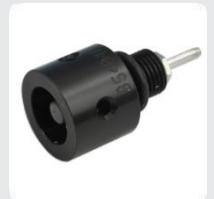
H6 Silver/Silver Chloride Half Cell 6004-0051