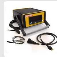
H29P Surface Display Pro' 6004-0079