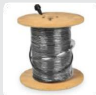
H30 BathyCorrometer to SDU Umbilical 100m 6004-0035