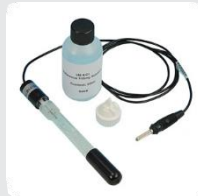
H124 Glass K-Series Reference Cell 6004-0013