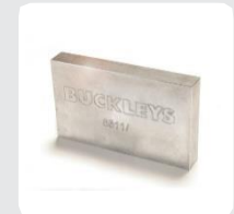
H9 Magnesium Test Block 6004-0053