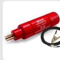
H3P CalChecker Pro' 6004-0080