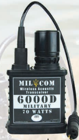
MIL COM 6000D