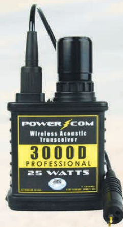
POWER COM 3000D