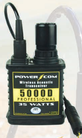
POWER COM 5000D