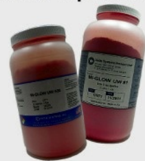
UW 1 and UW 528

We can supply MiGlow, Chemetall (Ardrox), Johnson & Allen and Magnaflux inks and consumables for use with all underwater MPI equipment. For more information, please contact our office.